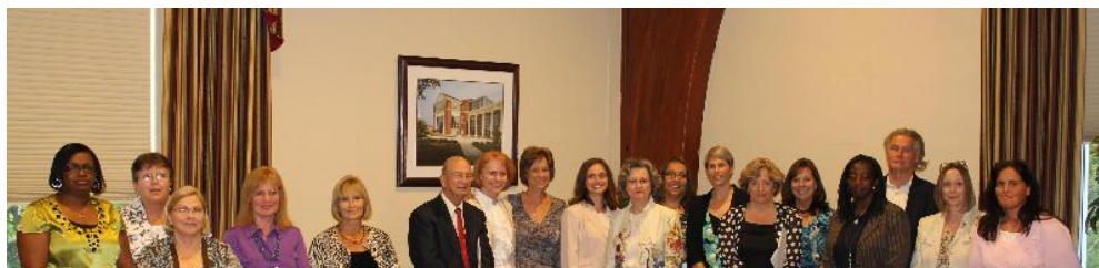
Presidential Service Award Recipients