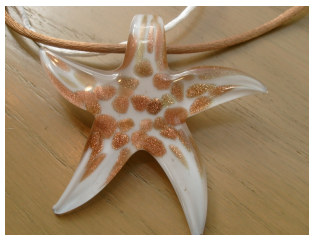
Order Starfish Necklaces On-line

Read the Starfish Story and View Additional Necklaces