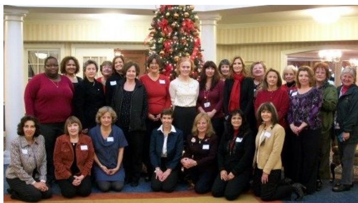
Twenty-five CASA Volunteers

and staff came together on December 7th for our annual volunteer holiday luncheon. The luncheon was held at Bentley Commons which provided a beautiful facility, as well as great food. Everyone enjoyed the opportunity to come together with fellow CASA colleagues and celebrate the holiday season. This was always a wonderful opportunity for CASA of Central Virginia to express our appreciation to our dedicated volunteers.